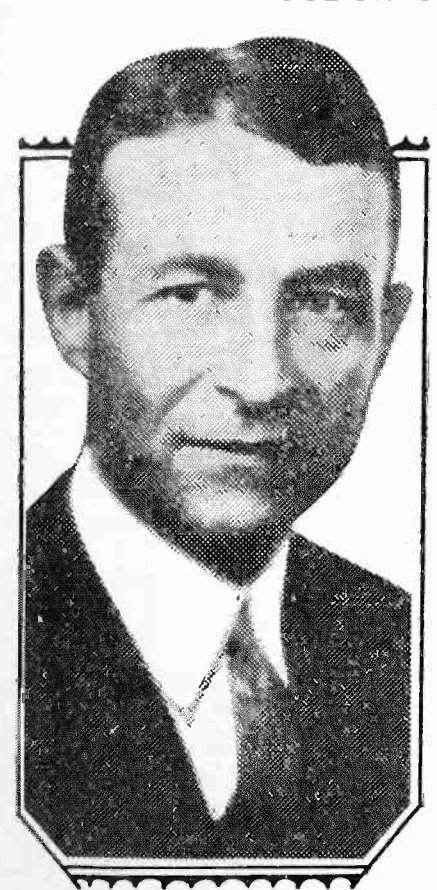
HON. D. PAULSON FOSTER

A series of talks entitled "Present Day Methods in Juvenile Court" are being delivered by Judge D. Paulson Foster each Sunday evening at 8:30 o'clock through Radio Station KDKA at Pittsburgh.